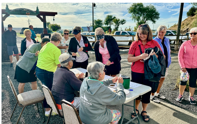
Registration table for Gayle Beck Tournament with fifty-two women playing golf on a sunny day at Alpine Meadows. A good time was had by all!