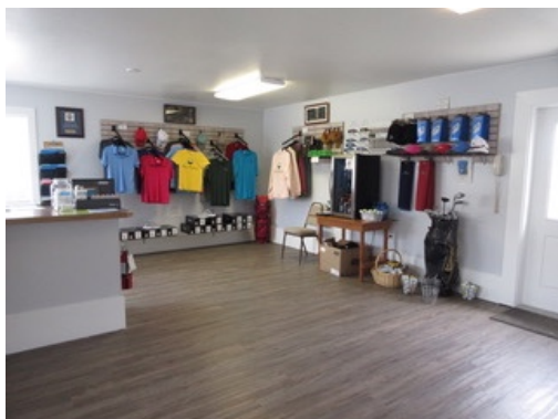
Check out what's new in the Pro Shop.